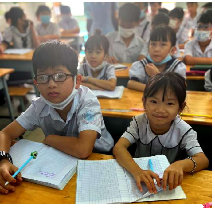
Pupils at the Binh Tan centre Ho Chi Minh - Vietnam