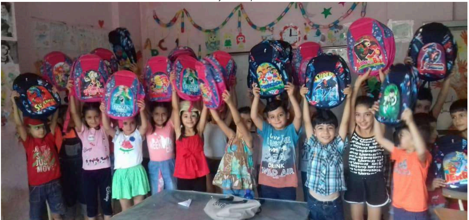
Distribution of school supplies