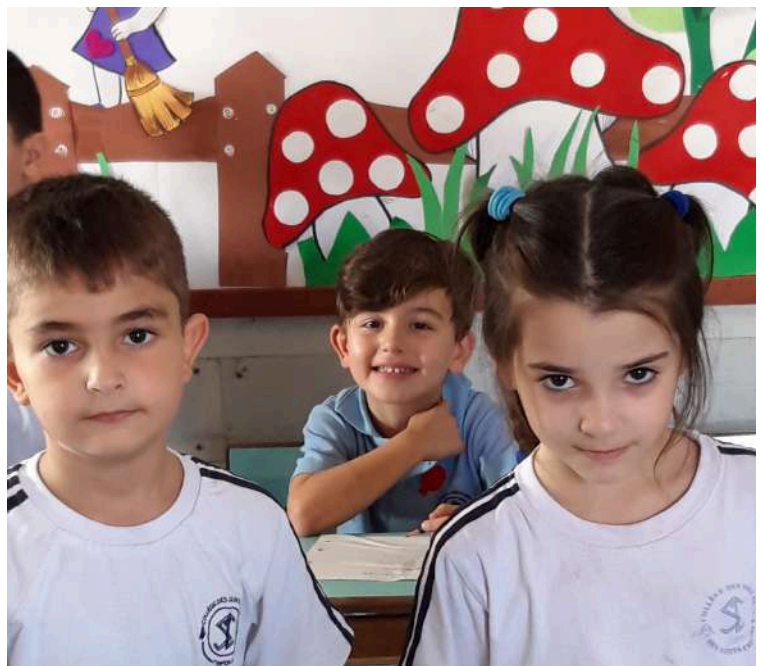
Children's schooling supported by school sponsorship