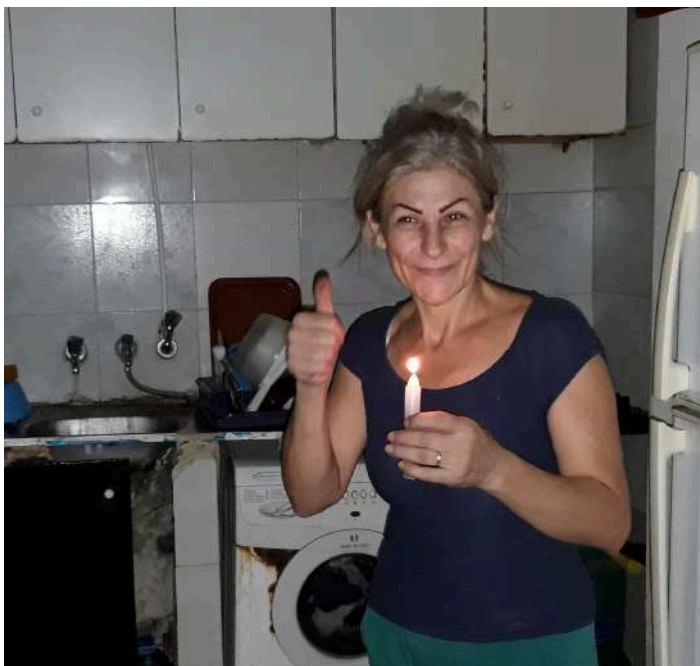
Bringing a little hope to a family in need