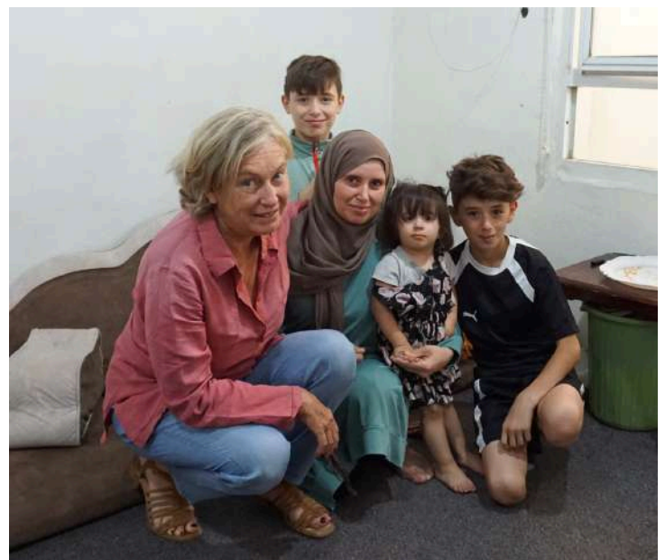
Visit from a displaced Yezidi family in Iraqi Kurdistan