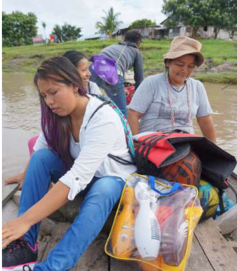
Reaching out to the most isolated

Our toy libraries, located in 5 regions of Colombia (Bogota, Choco, Boyaca, Amazonia), have enabled 13,000 children throughout the country to enjoy their childhood. The travelling toy libraries have continued in Amazonia, Choco and La Uvita, giving isolated children a window on the world and an opportunity to learn through play. Thanks to our toy library in Zaragoza, in the Amazon, we have been able to support the children of Peru, many of whom have been abandoned by their parents, who work in the coca fields and live in miserable conditions without an education. The importance of our toy libraries is fundamental in a new context of extreme violence linked to the impoverishment of the population.