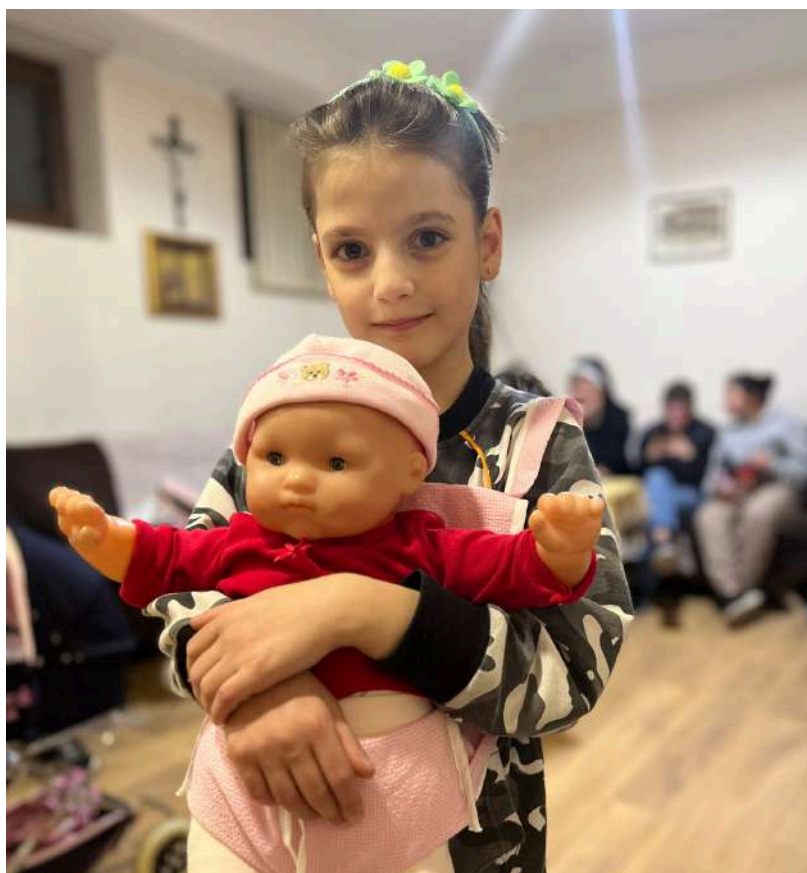
Child at the Boghossian centre