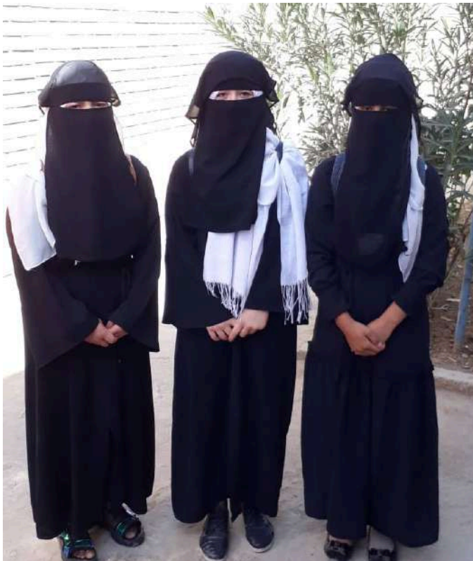
Compulsory dress for the few girls tolerated in our schools