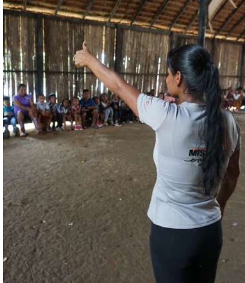
A committed team