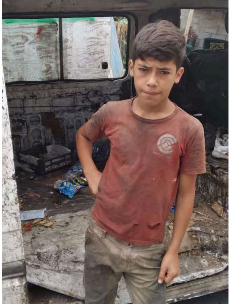
Boy helping his family by collecting rubbish in his neighbourhood

We continued our school sponsorship programme for 180 children via our 5 centres in Beirut and the surrounding area, including the Bekaa. We also financed university credits for many students in Beirut. We provided all the school equipment (books, kits, etc.) for the pupils of St Vincent de Paul.