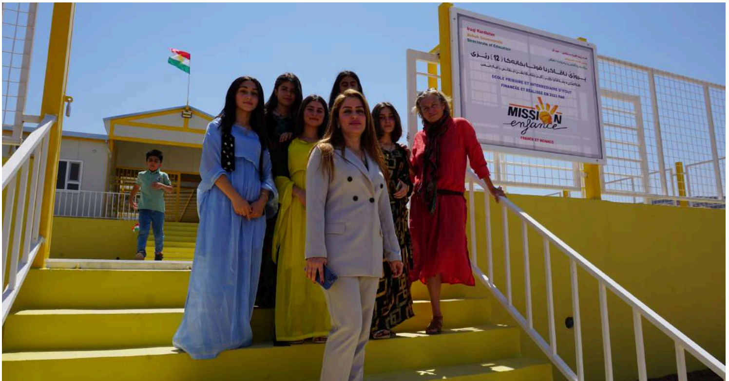
Construction of the Itout school for 1,000 displaced pupils

In Qaraqosh, we continued our support for Chaldean and Yezidi female students in Mosul, funding their transport, accommodation and food. Our education centre in the Sharya camp educates 600 displaced Yezidi children in Iraqi Kurdistan. The situation is very unstable in the Sinjar region, so the Yezidis prefer to wait for a lull in the fighting in the camps in northern Iraq. We have completed the construction of the Itout school for 1,000 displaced pupils in Iraqi Kurdistan, which will be inaugurated by the French Consul and the Mission Enfance team in July 2023.