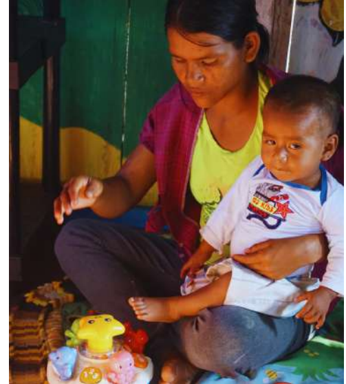
Support for underprivileged families