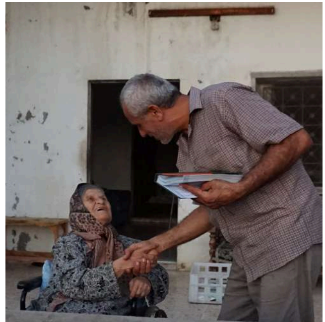
Financial aid for earthquake victims