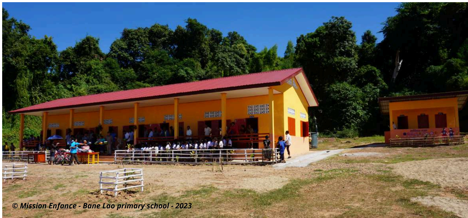
© Mission Enfance - Bane Lao primary school - 2023

Again, in the Champasak region, on the Boloven Plateau, we have built two primary schools in Phou Ding Deng and Bane Lao for isolated children. Each new school is complemented by the distribution of school furniture, school and hygiene kits to pupils and teachers, and the construction of a sports field. We have also provided food and financial aid to pupils and teachers in our 30 schools.